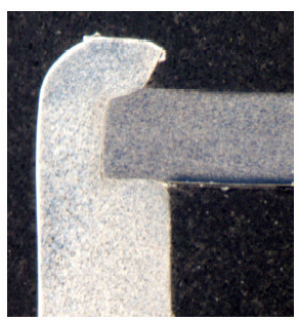
Stereomicroscope View 8 Power